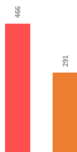
OPEN POSITIONS VS NEW MLTs

With an aging population, expansion of preventative medicine, and new pathogens; demand is only increasing for laboratory testing. Even prior to COVID-19, the annual increase in Ontario was 4% (more than double the projected rate of 1.8% annually). 9